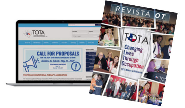
Exhibit Hall Schedule

Revista OT Newsletter Passport Donor Website Sponsor TOTA Tidbits Banner Ads