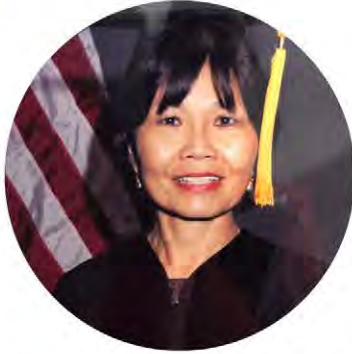
Occupational Therapy Professor