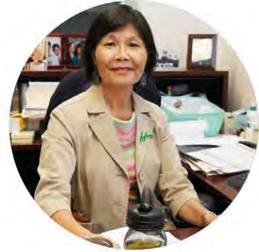
HCSS Vice President

The HCSS Campus 13151 W. Airport Blvd Sugar Land Texas 77478